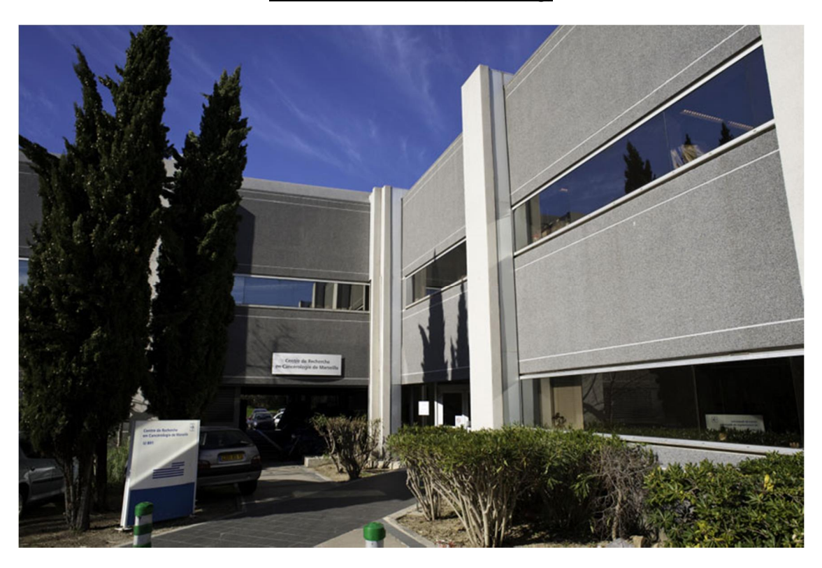
Institute of Tumor Immunology, Cancer Research Center of Marseille (CRCM) main building

From October 14<sup>th</sup> till November 22<sup>nd</sup>, 2013 I visited the Institute of Tumor Immunology in the Cancer Research Center (CRCM) of Marseille, France. My visit was coordinated under the twinning agreement between the Medical University of Warsaw and the University of Mediterranean in Marseille within WP1 (Task 1.2).